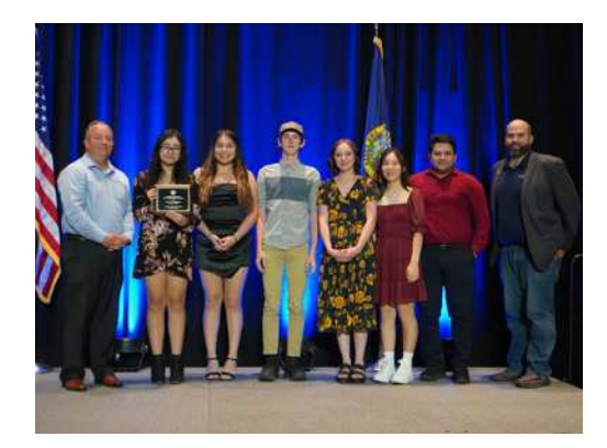
MERIDIAN MAYOR'S YOUTH ADVISORY COUNCIL