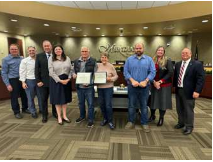
LOOSE SCREW BEER CO. Small Business of the Year