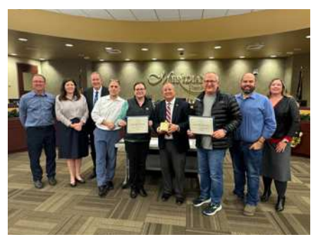
BERKELEY BUILDING CO. Large Business of the Year